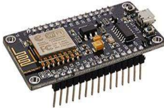
Figure : Wi-Fi module

released a software development kit(SDK) which is used to programme on the chip, so that another microcontroller is not used. Some of the SDK's are Node MCU, Arduino, Micro Python, Zerynth and Mongoose OS. SPI, I2C, I2S, UART are used for communicating between two sensors or modules.