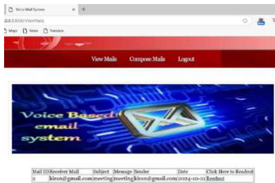
Fig.4.6 View Email

In view email option user can get details of sender email, subject, message, sender, sent date and Readout. The emails obtained are shown in this page. Using Readout button we can listen to the voice email. Similarly, physically handicap person also can use this application for both reading and compose.