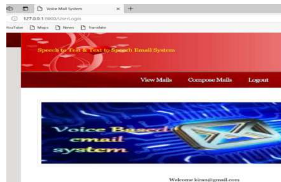
Fig.4.5 After Successful Login This Page Will Be Seen

In above page, application ask user details and the entered details will be checked with database. If credentials matched with database, then user will get below page,