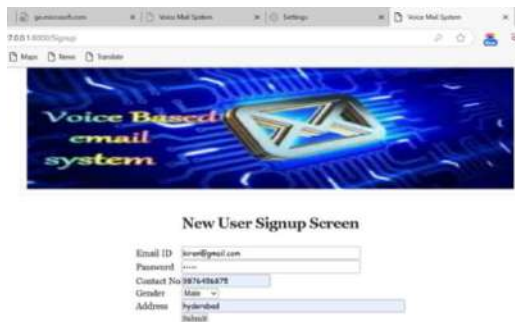
Fig.4.3 New User Signup Page

Above page is obtained as an index page (main page) when url is entered in any browser. This page has three options as 'Home', 'User Login', 'New User Signup'. Home is the main page access option for this application. 'New User Signup' option gives user to register with the application by entering the details. 'User Login' option gives registered users to access the proposed application. These options are accessed by voice of the user.