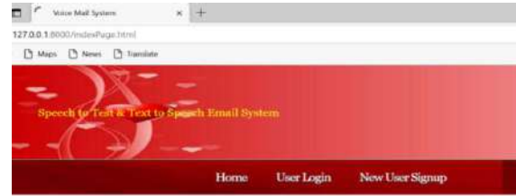
Fig.4.4 Click on User Login

Above new user signup page takes user details such as email ID, Password, Contact number, gender and Address from user and saves the details in MySQL database. These details are verified while user login.