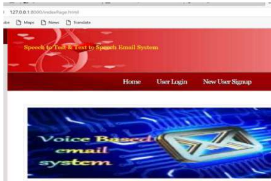
Fig.4.2 Main Page of the Application (index Page)

Above image shows that the proposed system is running on local host computer using Django framework. Django framework gives the url for accessing from local host the services. This url can be pasted in any browser to start the application. Below is the main page when we enter this url in any browser.