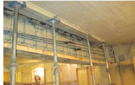
Figure No. 1 External Post Tensioning

gravity. Induced tensile stresses usually exceed pressure and reinforcement to provide the necessary strength and ductility, must be added.