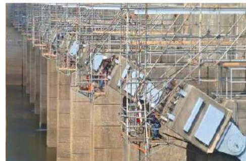
Figure No. 2 External Post Tensioning to restore or increase capacity