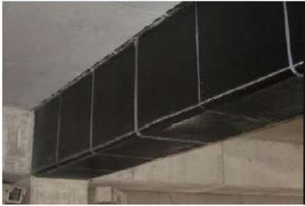
Figure No. 3 Carbon FRP fiber installation