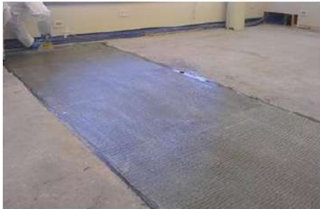
Figure No. 4 FRP Composite Strengthening services Concrete solutions